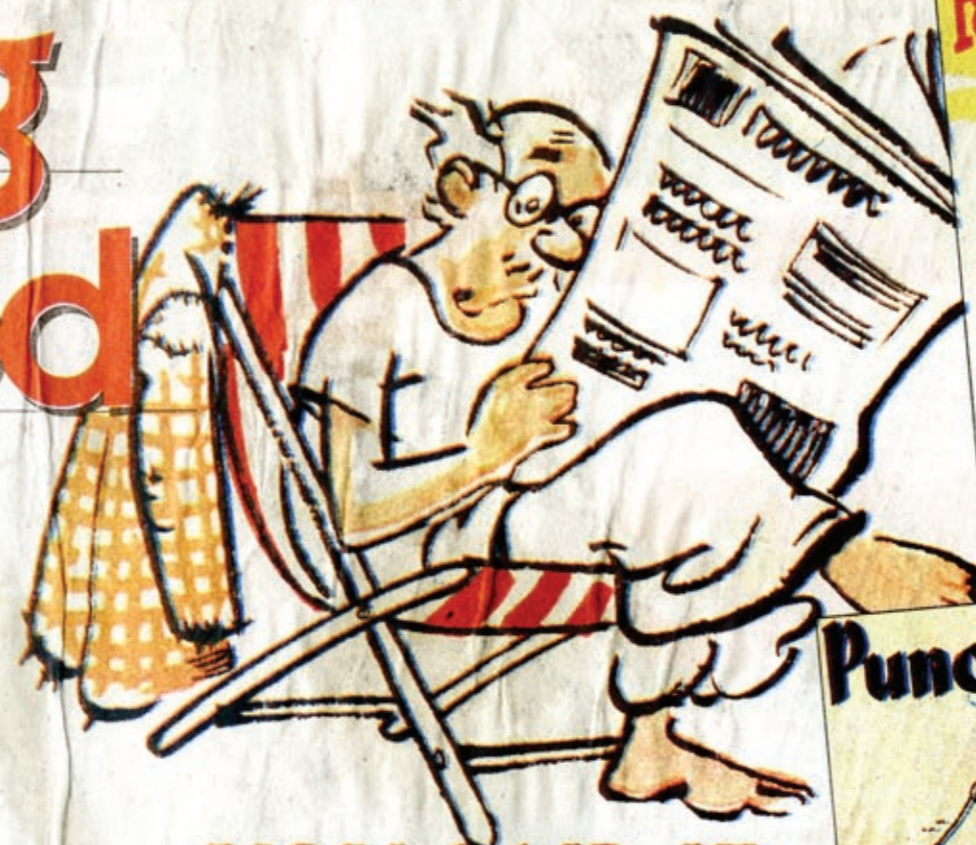
YOU SAID IT by R.K. Laxman